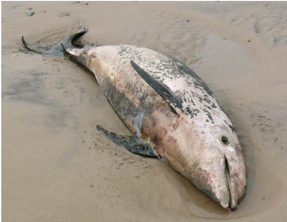
3. White-beaked Dolphin ( Lagenorhynchus albirostris ), Chevington Burn outlet, Druridge Bay, Northumberland, 2 June 2008.

If anyone finds a good Cormorant specimen please collect it from the shore and let me know so it may be passed to the Hancock Museum, Newcastle upon Tyne. The Museum is very keen to have one or two Cormorants for new displays. Chris Beneke found a Gannet corpse on the Durham coast on 19 April and he saved it. This is being preserved for our group. Alan Gilbertson saw this amazing White-beaked Dolphin (photo 3) on the shore of Druridge Bay on 2 June. When he checked again three days later it had been washed away. Alan took an excellent set of photos, is a keen birder and if he has time in the future may commence regular beach surveys with our group.