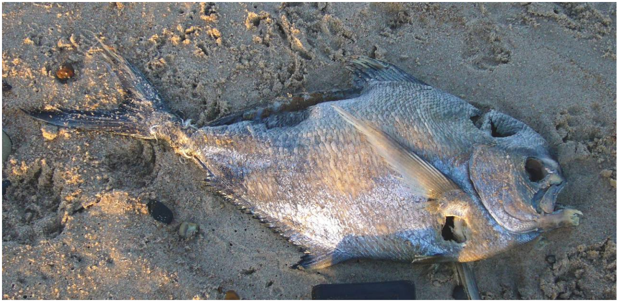
Photo 3 (above). Ray's Bream Brama brama , 23 Dec 2007, Blyth South Beach. Found by Steve Holliday. Scale: the edge of the black camera pouch, below the fish, is 10 cm long.