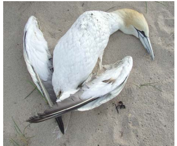
2. Gannet ( Morus bassanus ) adult, Cresswell, Druridge Bay, Northumberland, 10 May 2008.

If anyone finds a good Cormorant specimen please collect it from the shore and let me know so it may be passed to the Hancock Museum, Newcastle upon Tyne. The Museum is very keen to have one or two Cormorants for new displays. Chris Beneke found a Gannet corpse on the Durham coast on 19 April and he saved it. This is being preserved for our group. Alan Gilbertson saw this amazing White-beaked Dolphin (photo 3) on the shore of Druridge Bay on 2 June. When he checked again three days later it had been washed away. Alan took an excellent set of photos, is a keen birder and if he has time in the future may commence regular beach surveys with our group.