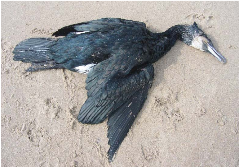
1. Cormorant ( Phalacrocorax carbo carbo ) adult, Blyth South Beach, 6 April 2008.