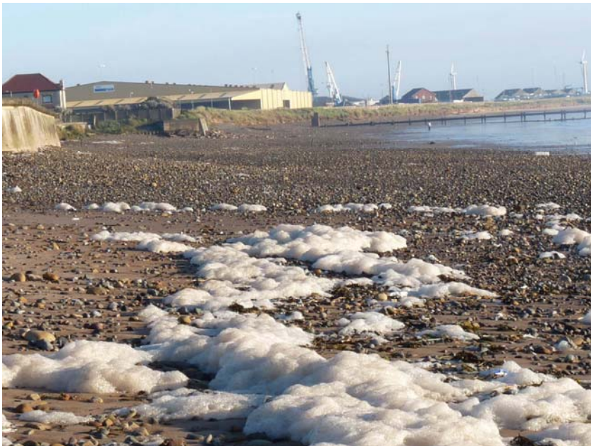
Blyth South beach, Northumberland, Sept 2010. This normal sandy beach was reduced to a stony surface for a while due to heavy seas.