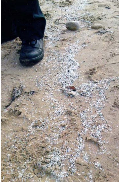
Small sharp plastic shards on the beach at Roker – Seaburn, Oct 2010.