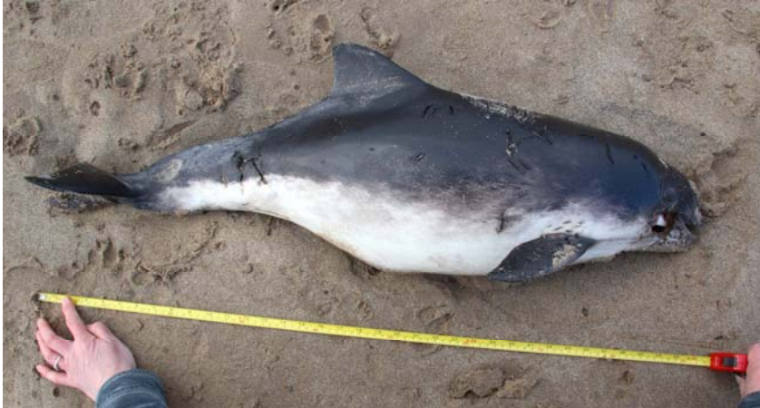
Harbour Porpoise, Druridge Bay, Northumberland, 27 March 2011, finders LKC / DMT. Length 98 cm