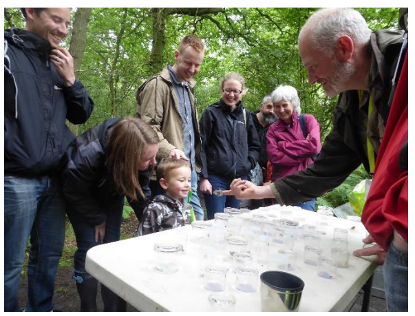
NHSN volunteers lead inspiring Reserve Open Days

The project involves three key stages as shown below: