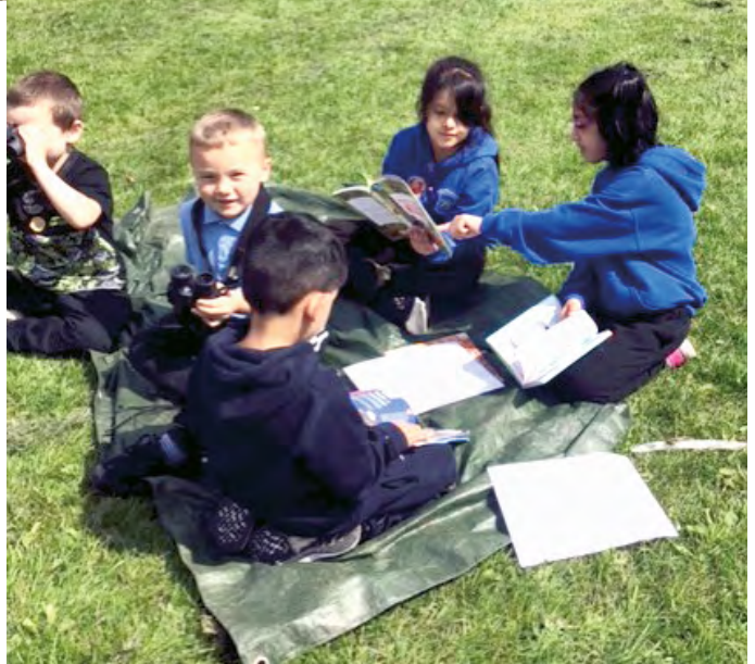
Children at English Martyrs enjoying Plan A activities

Natural History Society of Northumbria, Great North Museum: Hancock, Newcastle upon Tyne, NE2 4PT