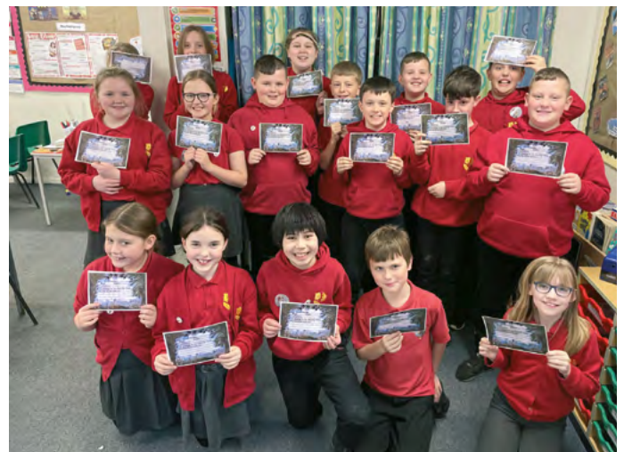
Children at Parkhead Primary School were very excited to be part of the class where pledge 1000 was made.

“ The sessions weren't just about the pledges at the end, but seeing young people connect with nature, children who initially didn't want to go outside or said they didn't like nature, had a great time, moments like that can't be bottled. ”