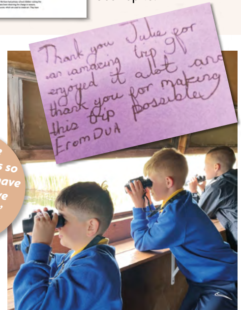
Children using newly purchased binoculars at Gosforth Nature Reserve.

'I am going to turn off lights when I leave the room to save electricity' Lewis, age 9