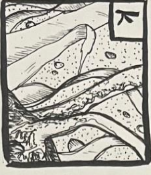
Keep Rimouth Beach 22nd February