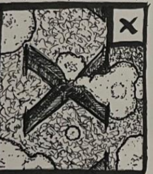
X's covered in lichen, Bab church yard, 20th Feb