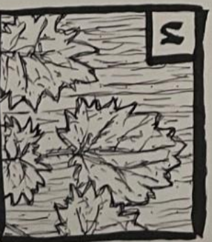
Urtica, nettles, February 25th