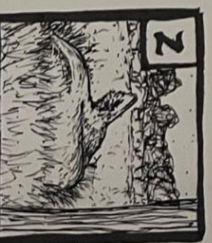
zzz, doe asleep in our garden, 28th February