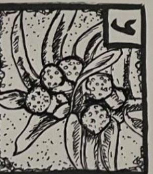
New flowers at Hardwick Park, February 2nd