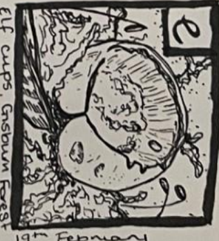
Elf cups, Garsburn Forest 19th February