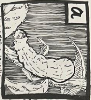
Angle shades caterpillar at night, 3rd February