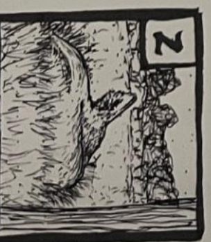
Fern, Bilton by Bowland 18th February