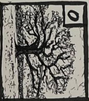
Oak, Bilton 18th February