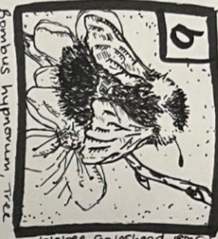
Bombus hypnorum, tree Bumblebee, Gateshead 18th Feb.