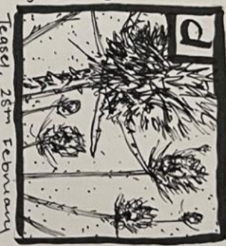
Teasel, 25th February