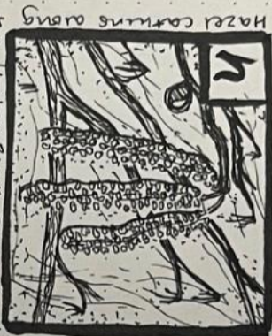
Hazel catkins along the Horton Burn, February 8th