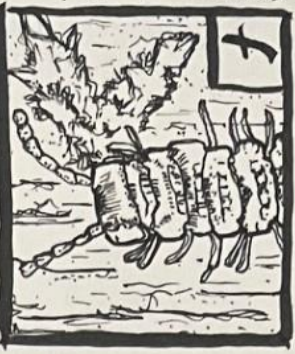
Flat-backed millipede Hillwell Drive, 15th February