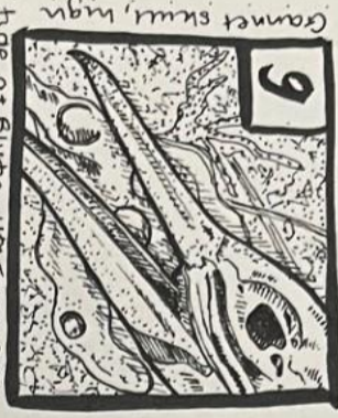
Garnet skull, night Koe at Blyth, 11th February