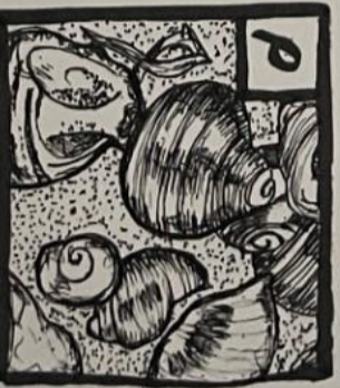
Periwinkles, Bowland Beach, 22nd February