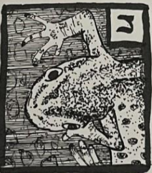
Newt on our drive 10th February