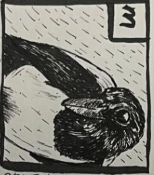
Magpie - One for sorrow. 9th February