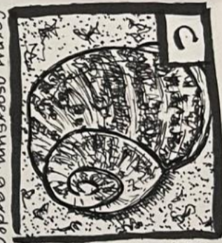
Cornu aspersum, garden snail, February 4th