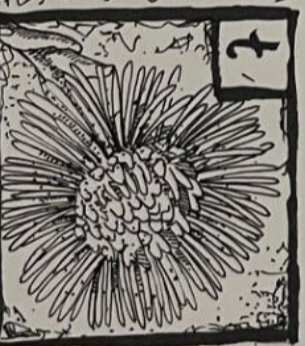
Tussock of tussock grass, Foot, Blyth, February 15th