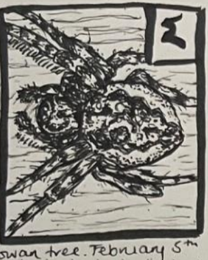
Walnut orb weaver on our Rowan tree, February 5th