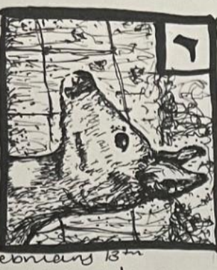
Doe Deer, west Hartford February 13th