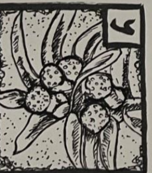
Jelly ear, Gosforth Nature Reserve, February 10th