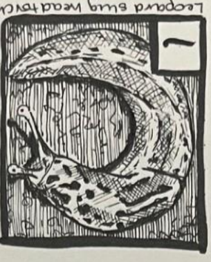
Leopard slug head torch Hurd, 4th February