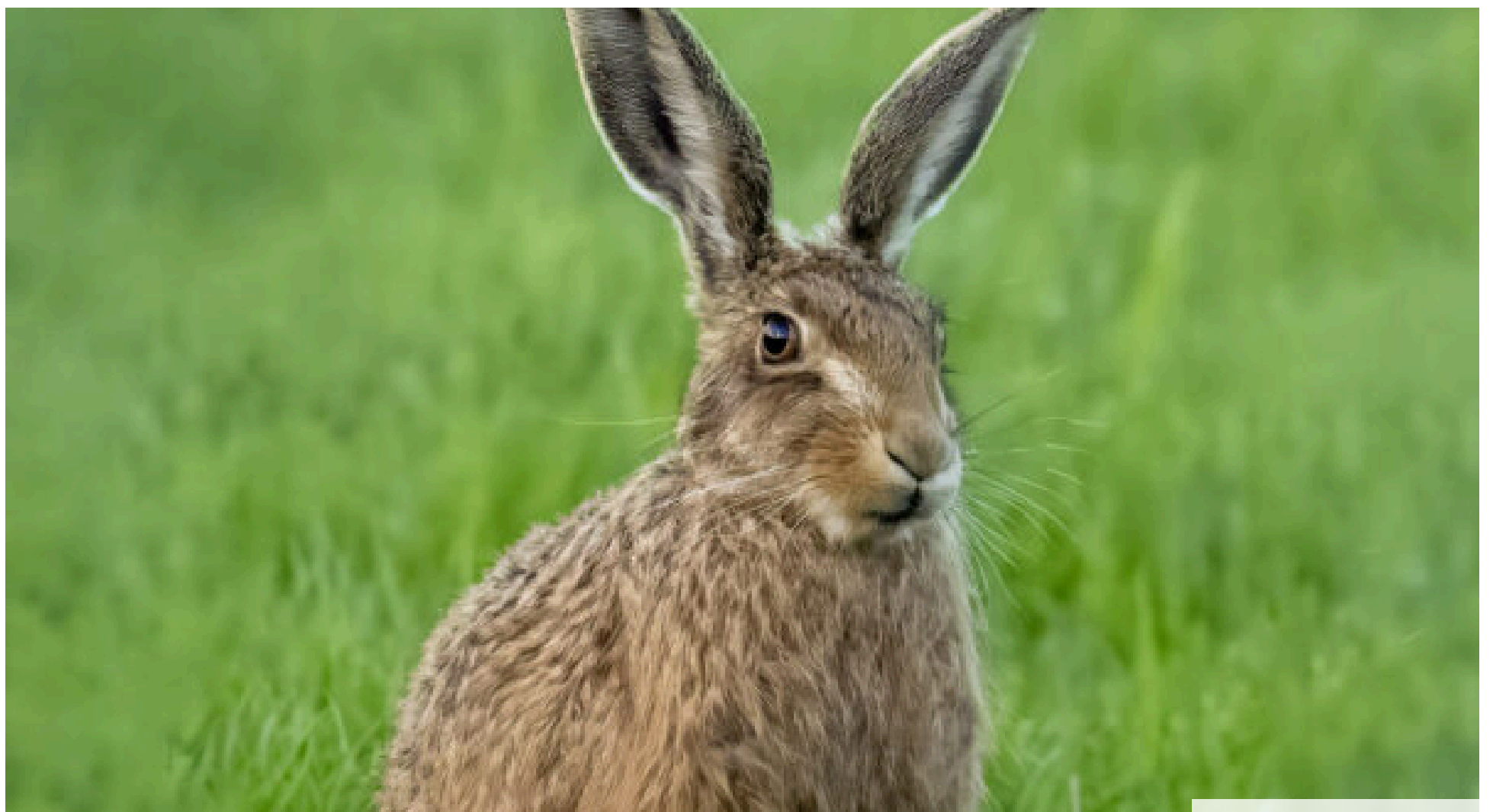
Brown Hare