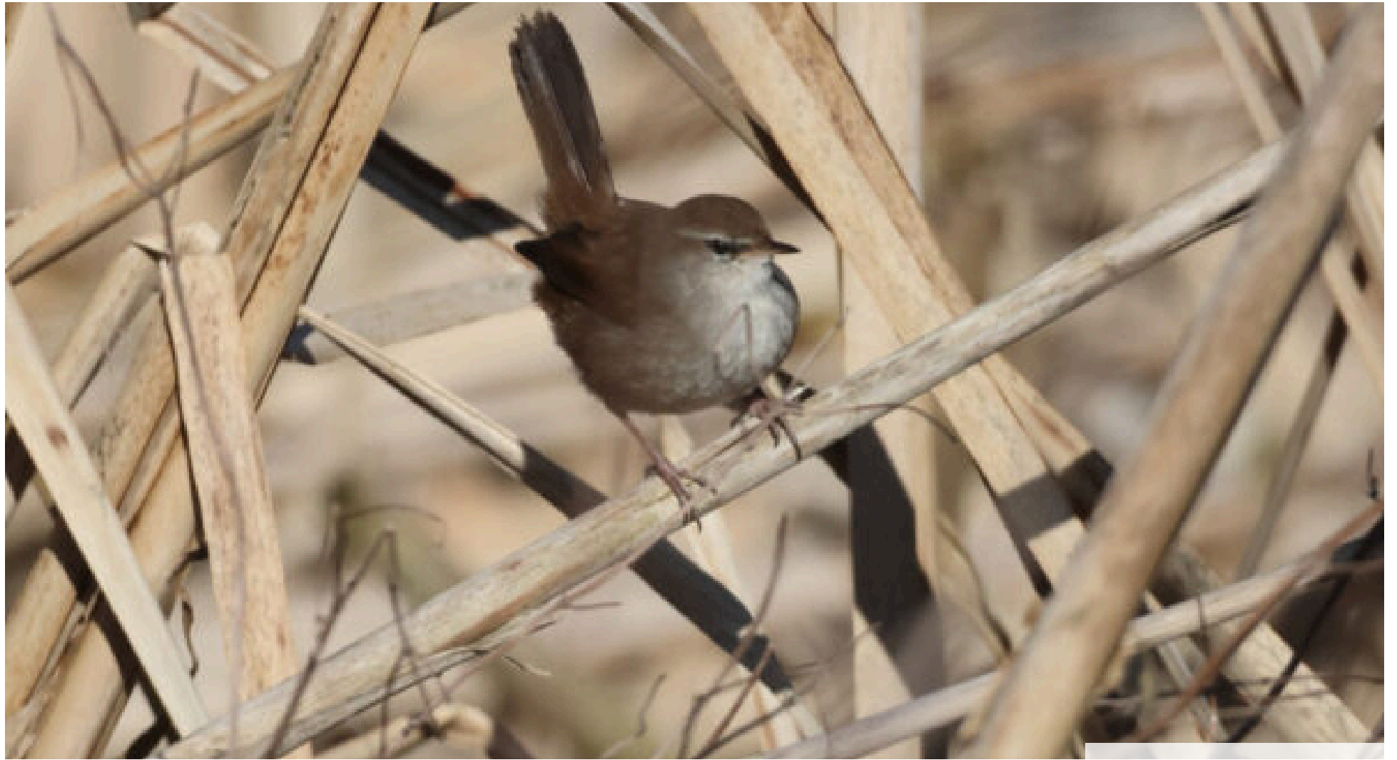
Cetti's Warbler