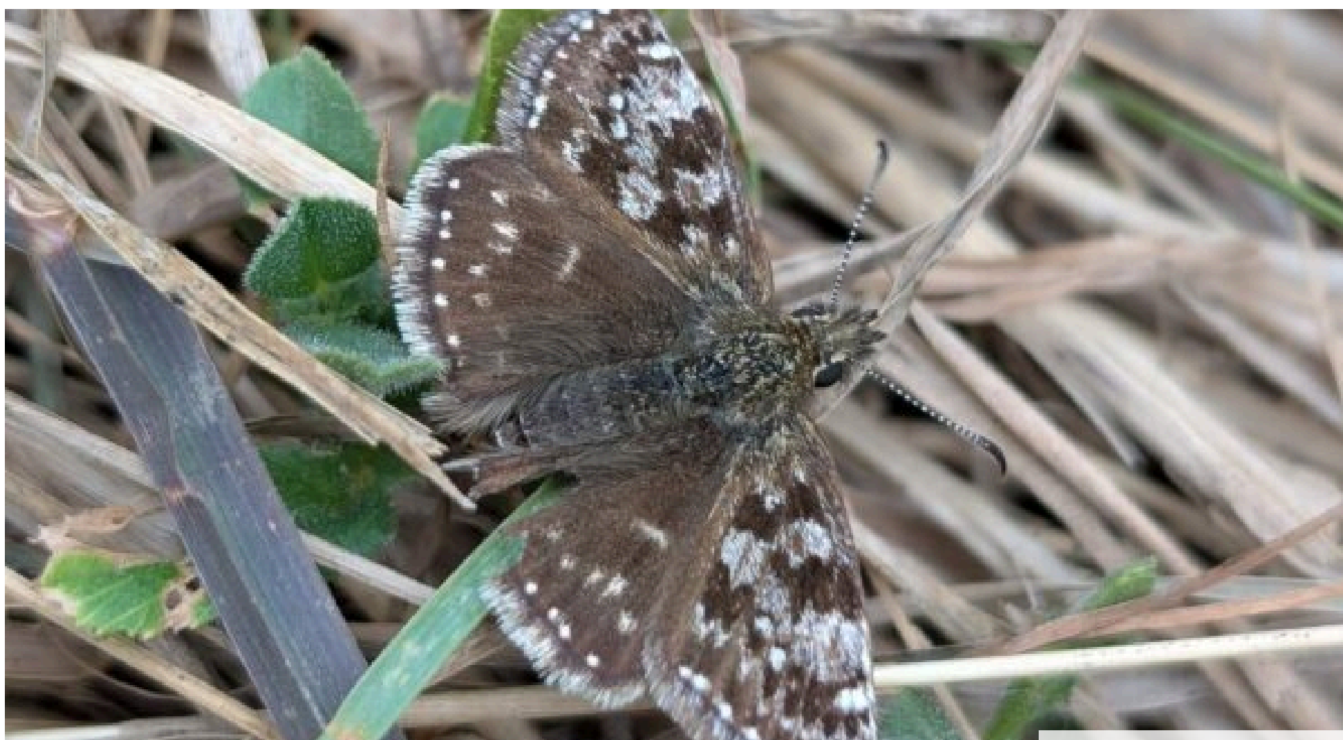
Dingy Skipper