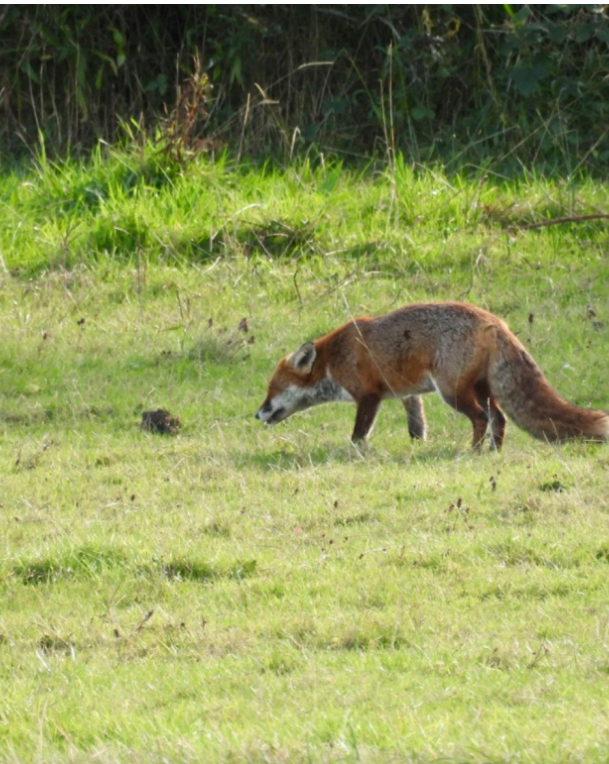
Red Fox