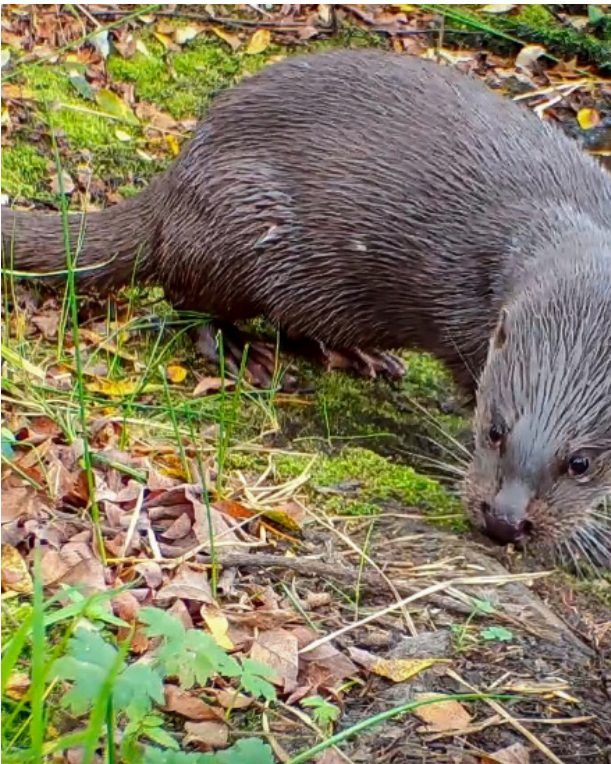
Otter © Christopher Wren