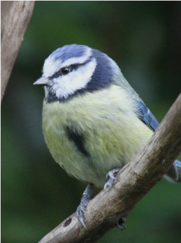
Blue Tit