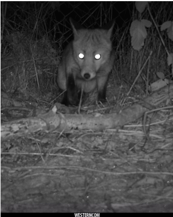
WESTERN.COM Red Fox © NHSN