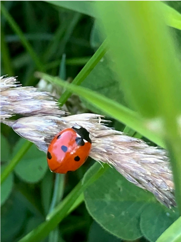
7-spot Ladybird