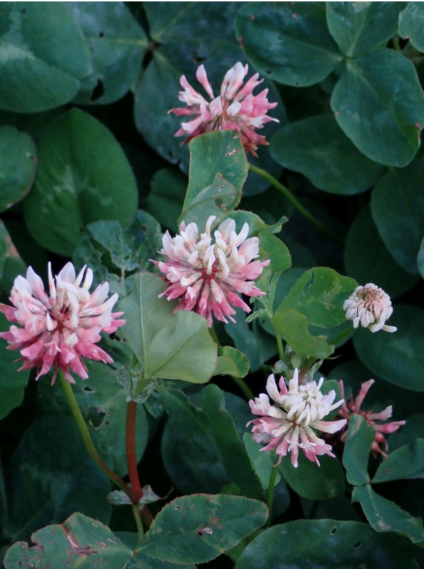
Alsike Clover