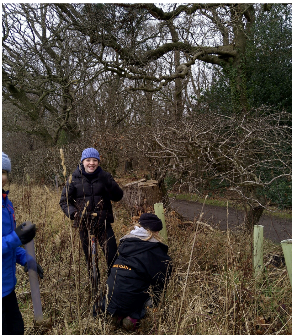
Tree planting with Dame Allan's School