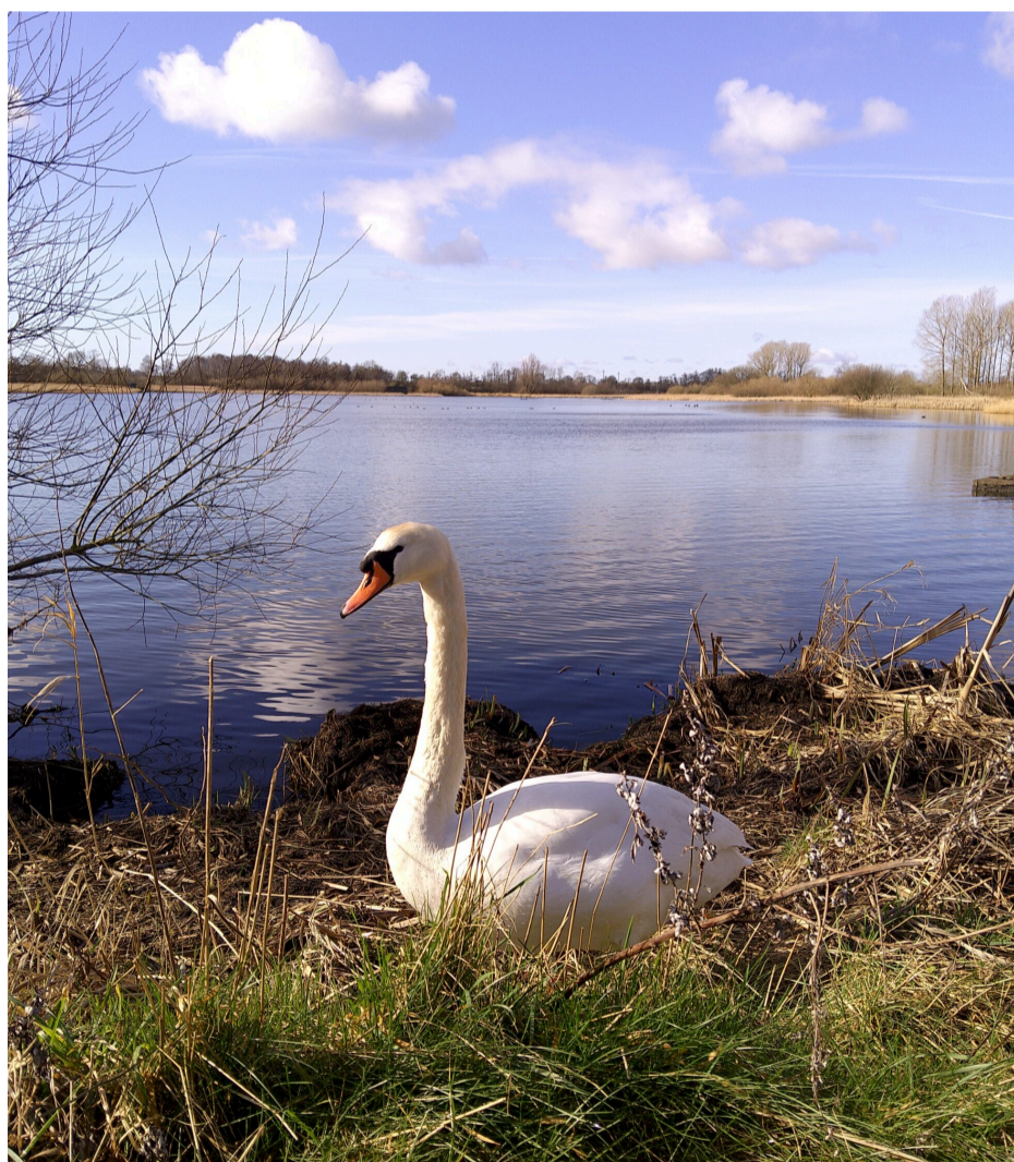
Mute Swan at Big Waters Nature Reserve

Overall, February has been a wonderful month for wildlife and events within the community. It has been a pleasure to see so many new faces on nature walks and we are so excited to see what the rest of the spring has to offer!