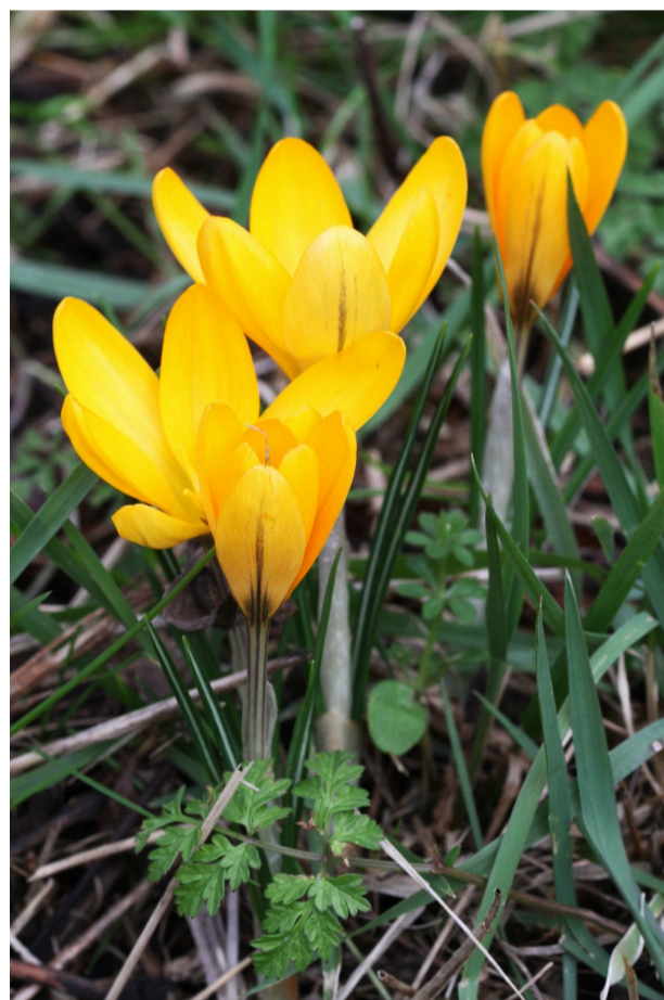
Yellow Crocus