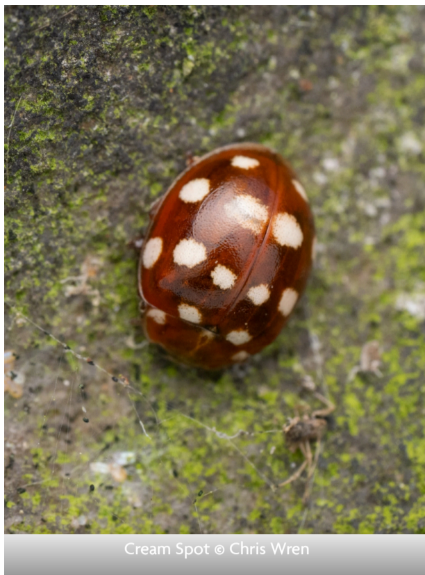
Cream Spot