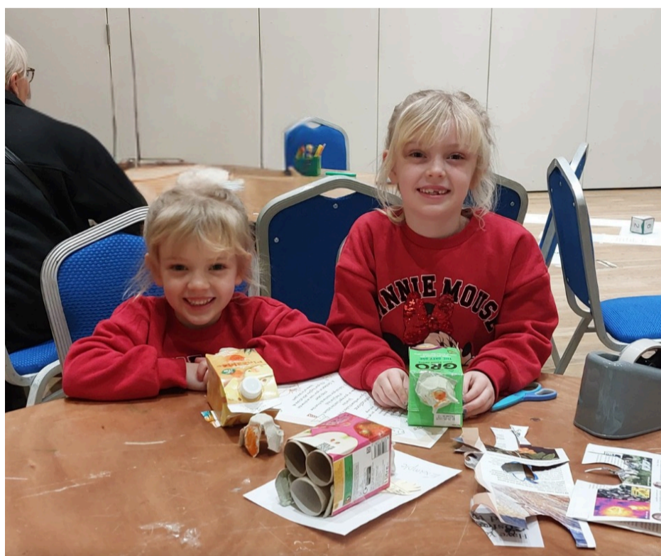
Crafts at the Great North Museum: Hancock

And finally, ending another exciting month, we worked with three schools for their series of nature activity sessions with us, learning about nature, creating nature art, and discovering how to connect with nature more. Working with Year 1s from Kingston Park Primary School, Year 4s from Wingrove Primary School and Year 8s from Dame Allan's School, we have been able to enjoy working in the primary school's forest school areas, going on bug hunts, identifying trees and creating nature art. With the students from Dame Allan's, working on their Young Naturalist Award 2025, we had a session planting nearly 200 Hawthorn trees along the field margin at Gosforth Nature Reserve to fill the gaps in the hedge. The students then went on to explore the reserve to compare their sightings against their visit in the autumn.