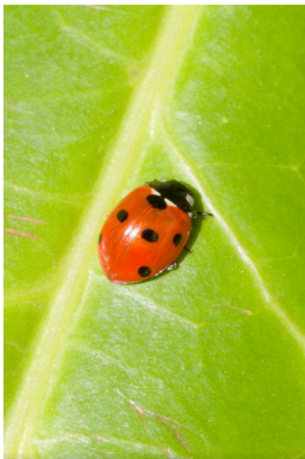
7-spot © Chris Barlow

We can't wait to see what wildlife you have been seeing in March!