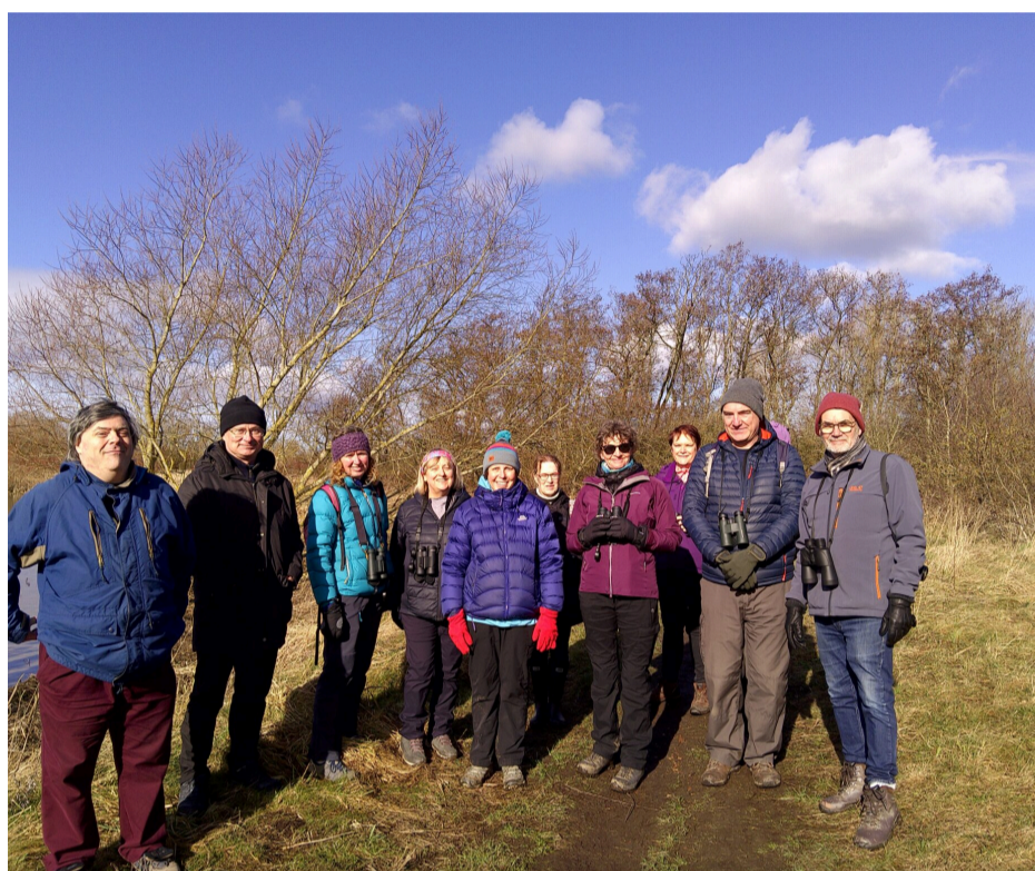
Community bird walk at Big Waters Nature Reserve