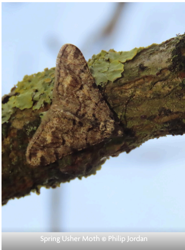
Spring Usher Moth